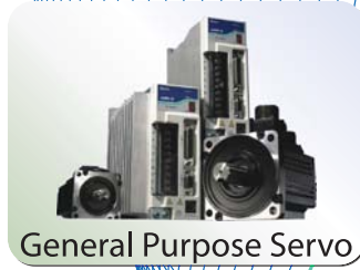
General Purpose Servo