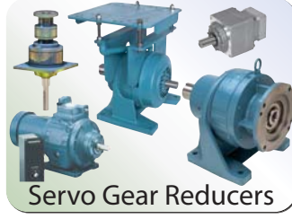
Servo Gear Reducers