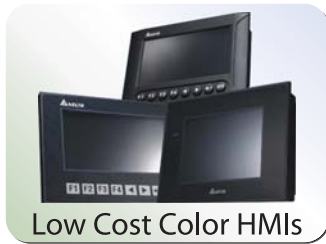
Low Cost Color HMIs