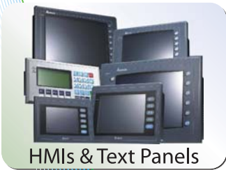
HMI & Text Panels