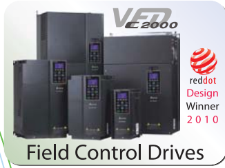
Field Control Drives