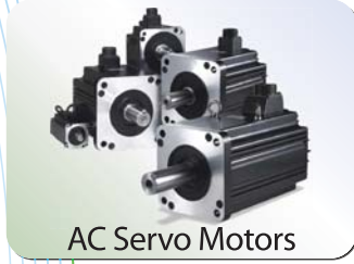
AC Servo Motors