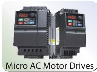
Micro AC Motor Drives