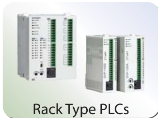
Rack Type PLCs