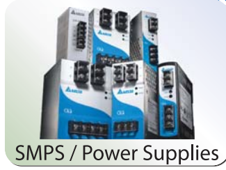
SMPS / Power Supplies