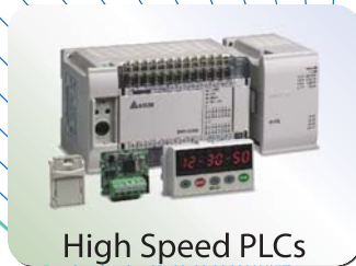
High Speed PLCs