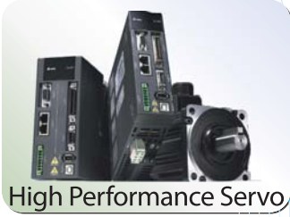
High Performance Servo