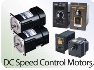
DC Speed Control Motors