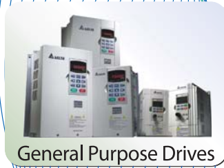
General Purpose Drives