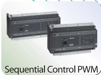
Sequential Control PWM