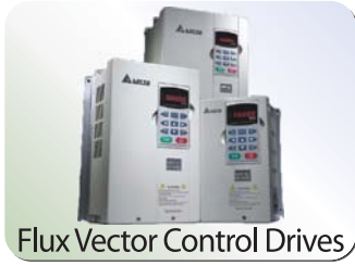
Flux Vector Control Drives