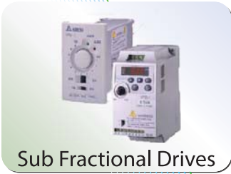
Sub Fractional Drives