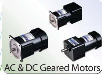
AC & DC Geared Motors